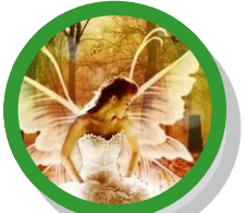
Blessing In Disguise

Blessing in Disguise creates a positive focus on enabling freedom to enjoy treasured memories to share with family and loved ones and provides a range of life enhancing experiences helping to improve the quality of life for children and young people with disabilities or life limiting illnesses.