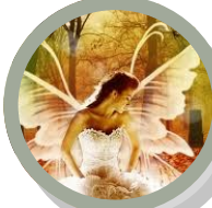
Blessing In Disguise

Blessing in Disguise creates a positive focus on enabling freedom to enjoy treasured memories to share with family and loved ones and provides a range of life enhancing experiences helping to improve the quality of life for children and young people with disabilities or life limiting illnesses.