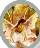
Blessing In Disguise

We are a socially responsible organisation, providing much needed support to many children, young adults & their families / carers by providing, free of charge, a range of life enhancing equipment, activities and social/ recreational opportunities for the whole family. Through personal experience, we know that it can often be difficult on other family members, who perhaps unfortunately miss out, but we will endeavour to encourage them to achieve positive changes. With the right funding we have the potential to increase the number of vulnerable people that we support each year, providing much needed equipment to more families across the UK and making a significant difference.