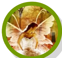
Blessing In Disguise

Blessing in Disguise creates a positive focus on enabling freedom to enjoy treasured memories to share with family and loved ones and provides a range of life enhancing experiences helping to improve the quality of life for children and young people with disabilities or life limiting illnesses.