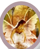
Blessing In Disguise

Thank you to Santa & Mother Christmas, St Johns Church, Carrs Pasties, Park Cakes and Fazilla Foods for creating special memories for the attending families.