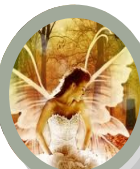
Blessing In Disguise

Blessing in Disguise creates a positive focus on enabling freedom to enjoy treasured memories to share with family and loved ones and provides a range of life enhancing experiences helping to improve the quality of life for children and young people with disabilities or life limiting illnesses.